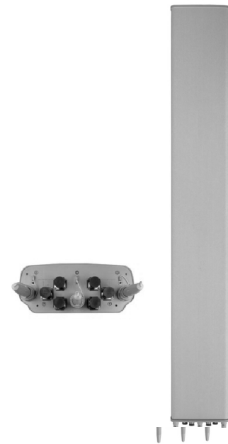
H&V Pattern/ Broadband